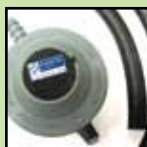
Components of the LPG gas system