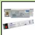
Ballast for tubular fluorescent lamp