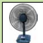
Table fan/standing fan