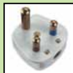
3-pin round type 15-amp plug