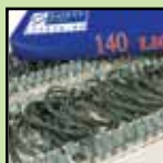
Decorative lighting fixture