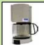
Coffee maker and similar appliances