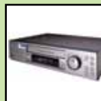
Video cassette recorder