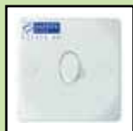
Domestic electric wall switch