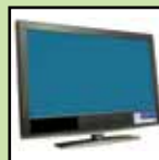
Television/video display unit