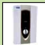
Instantaneous electric water heater