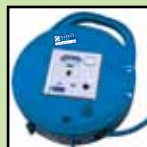
Portable cable reel