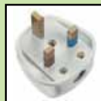
3-pin rectangular type 13-amp plug