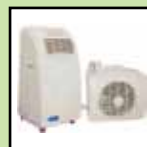
Mobile split air-conditioner