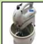
Mixer and similar appliances