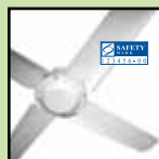
Ceiling fan/wall fan