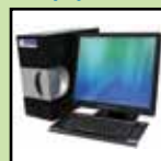
Home computer system