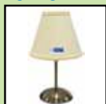
Table lamp/standing lamp