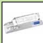
Isolating transformer for downlight fitting