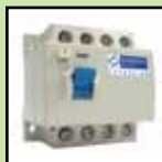
Residual current circuit breaker