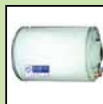
Mains pressure electric storage water heater