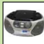
Any other audio products