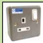
3-pin 13-amp socket-outlet