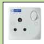
3-pin round type 15-amp socket-outlet