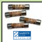
Fuse ( \leq 13 -amp) for use in plug