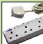
3-pin portable socket-outlet