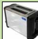
Toaster, grill and similar appliances