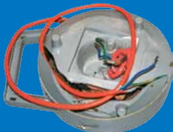
Non-registered products could be a safety hazard.

When purchasing Portable Cable Reels and Portable Socket Outlets, look for the SAFETY Mark with the statements as indicated below.