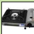
Portable cooking gas appliance