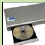
Laser disc set