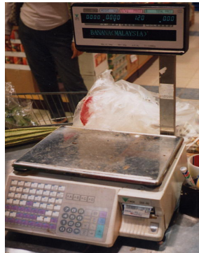
Non-automatic weighing instruments

Below are some examples of weighing and measuring instruments that are used for trade purposes that will be verified and stamped by AVs.