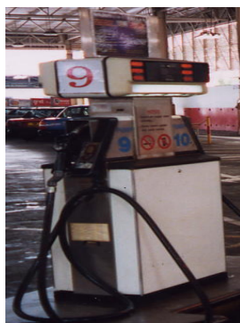
Oil dispensing pumps